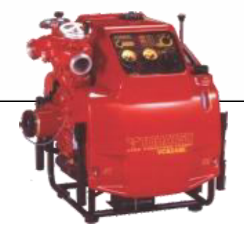
Model: VF 53AS